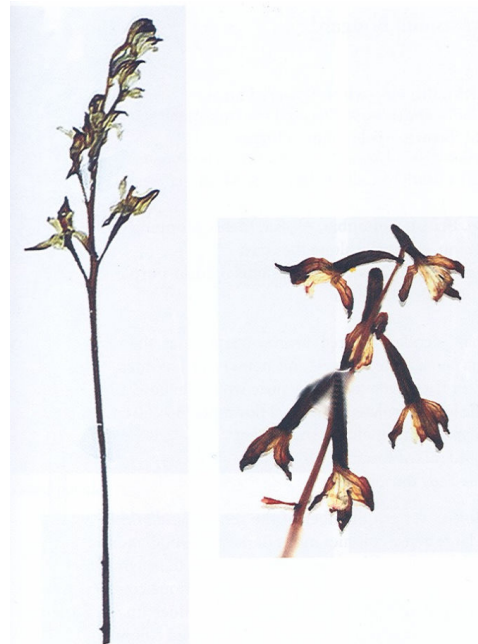
Dried Specimen from Oregon State University Sorry, No other photos available!