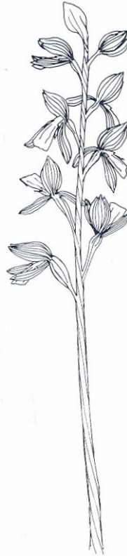
Drawings from Wild Orchids of the Pacific Northwest and Canadian Rockies