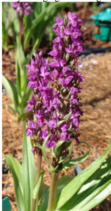
Dactylorrhiza purpurella ‘Inverness’

Just a reminder, mulch your Dactylorrhizas well during the colder winter weather. The shoots for next year are already emerging from the ground.