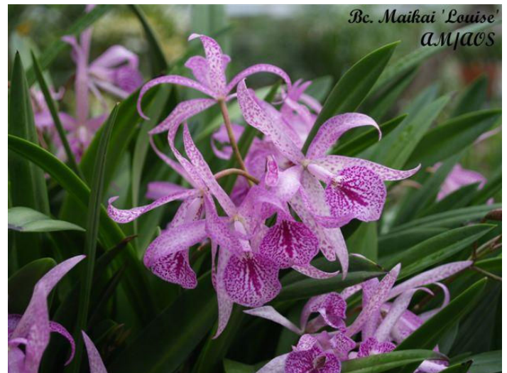
Bc. Maikai 'Louise' AM/AOS