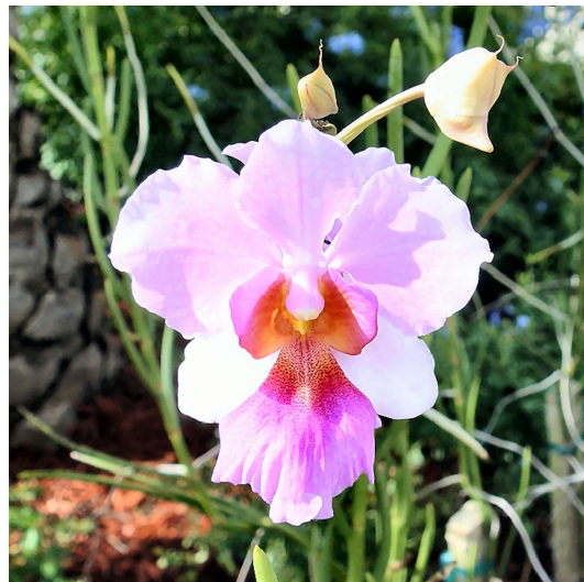
AOS picture and article

Vanda Miss Joaquim is Singapore's national flower, chosen in 1981. It was first discovered in the garden of Miss Agnes Joaquim in 1893. The selection of a national flower was part of Singapore's effort at fostering national pride and a sense of identity. Vanda Miss Joaquim was selected particularly because of its hardy and resilient qualities and its ability to bloom throughout the year. It is an indigenous hybrid between the Vanda teres and the Vanda hookerana.