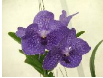
Ron's hanging Vanda.

Visitors were in awe of the varied selection of orchids that we displayed, especially