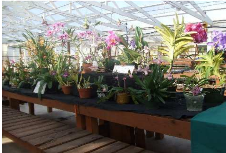
Olympia Orchid Society display