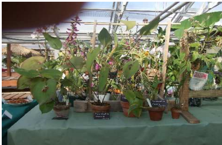
Club member, Ken Tokach's display of plants