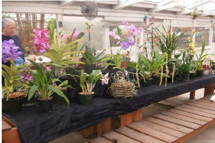
Ferrell Ellie's display