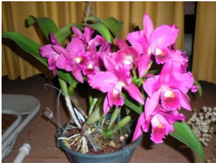
C. Chocolate Drop 'Mt. View' x LC Bethune 'Indigo'

There were no entries in the species category.